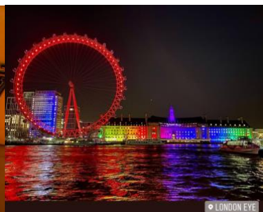
The London Eye