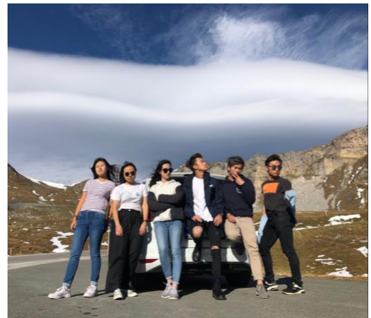
Picture taken on the alps with our car

October is probably the most exciting month for me throughout the whole exchange: started to get familiar to the places and things around me, the weather also started to be colder, and I got to have a road-trip with 6 of my friends! We have travelled to Czech and Austria within the 9-day trip. We went up on the Alps and deep in the ice cave and salt mine. It was really a wonderful and spectacular journey!