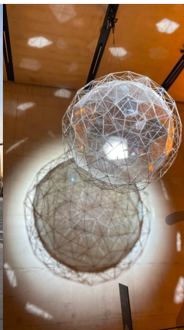
Tate Modern, London