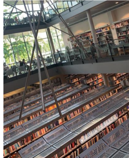
The library of CBS

I arrived Copenhagen on August 26. It was a pretty warm day and I was so exhausted after more than 10 hours of flight. The weather in Copenhagen is extremely hot in August and the student dorms are not equipped with air-cons but only heater/warmer. I spent most of time in the week to get myself familiar with places and the heat over there.