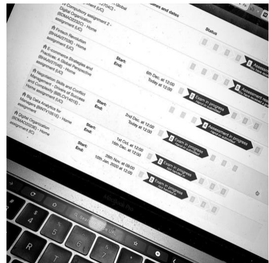
The digital exam portal of CBS...

November is a month where my life there at Copenhagen started to get hectic. The first term written paper and job interviews were kicking in (so sleepless nights started). I managed to get to travel to two countries still: Italy for 12 days and Iceland for 5 days. The worst thing ever happened in November though: I got my phone stolen during my trip in Italy. So make sure that you are very aware and alert about anything happening around you on the metro.